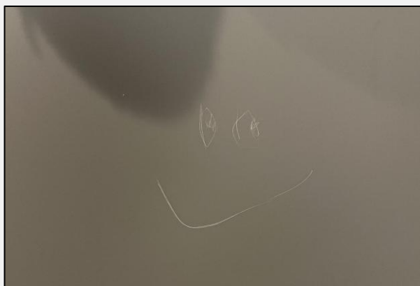
But not even the new construction was spared.