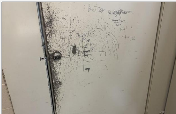
The parish hall restrooms were first brought to my attention.

Parents, please make sure your children are aware of the cost of such vandalism in time and money.